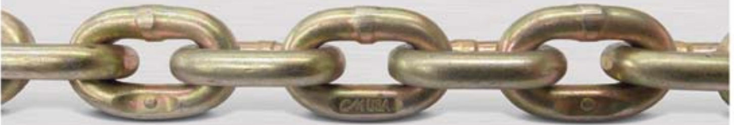
Gold chromate chain pictured above (3 & 6 ton and special lift units).